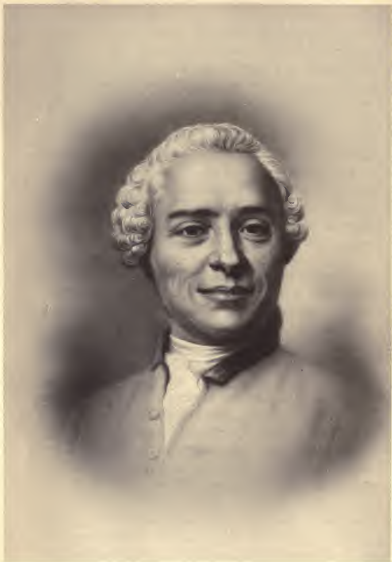
JEAN LE ROND D'ALEMBERT.